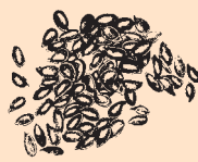
British Grown Linseed