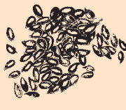
British Grown Linseed